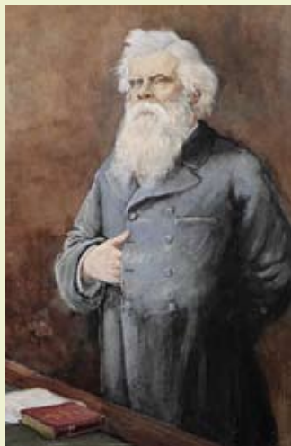
Portrait of Sir Henry Parkes, 1887